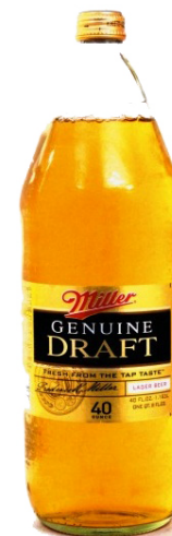
MGD 40-oz bottle